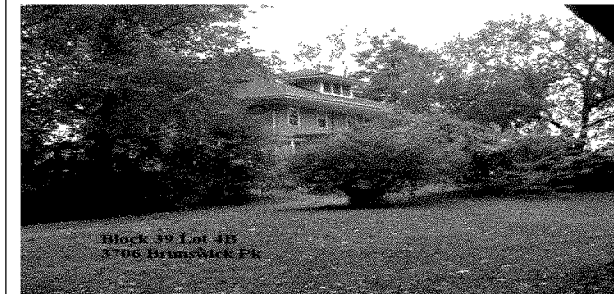
Block 39 Lot 4B 3706 Brunswick PK