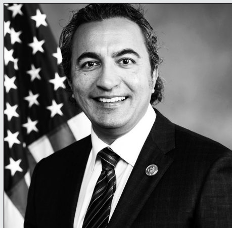
Congressman Ami Bera, D-California

bers of the House, one of the DCCC's top priorities will be shoring up members from tough districts, the DCCC said in a